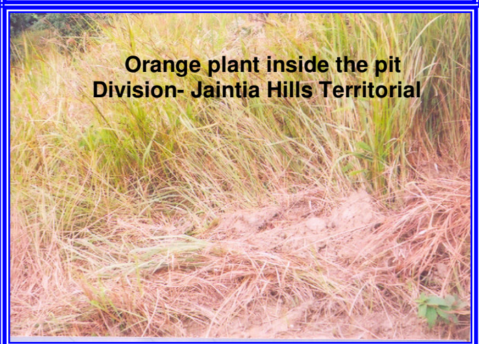
Orange plant inside the pit Division- Jaintia Hills Territorial