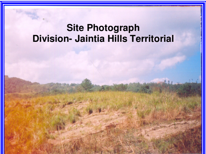
Site Photograph Division- Jaintia Hills Territorial