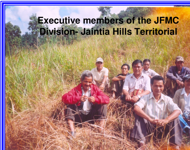
Executive members of the JFMC Division- Jaintia Hills Territorial

Sponsored By National Afforestation & Eco-Development Board (NEAB), MoE&F, Gol